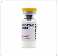
MOTS-C 10mg - MTC0001