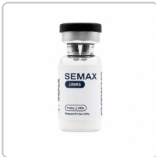
Semax 10mg - SMX0001