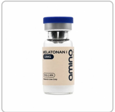
Melanotan I 10mg - MI0001

Identity: Melanotan I Peptide Purity: 99.68%